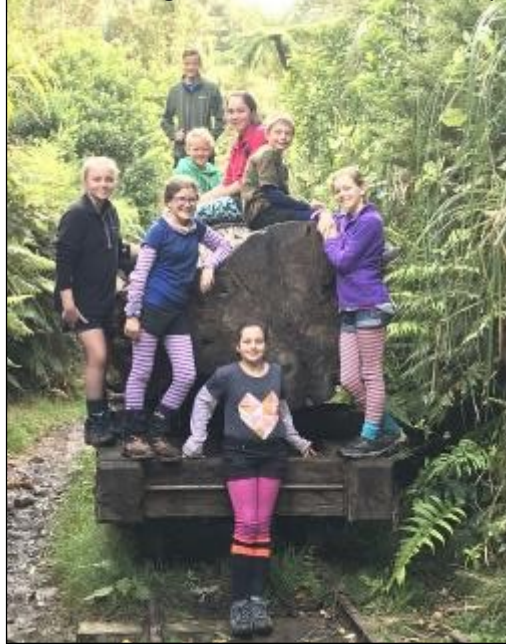
On the Bogie - Waitewheta Tramway